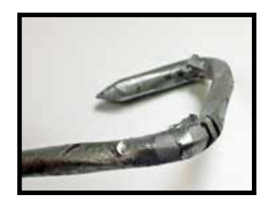
Competitor's Galvanized Nail