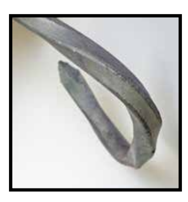
Genuine Tree Island Steel Hot-Dipped Galvanized ZincGard® Nail